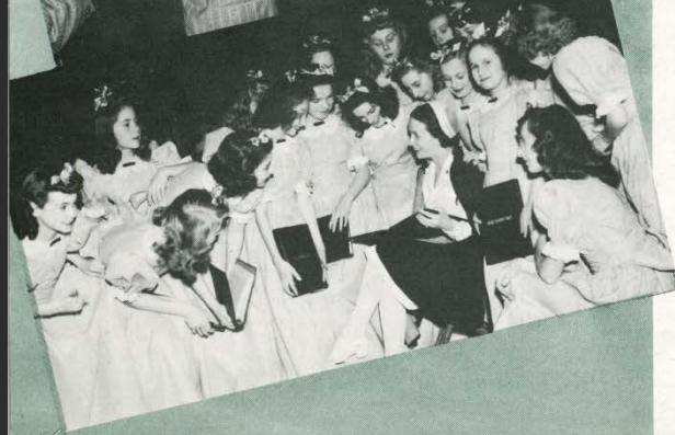
Nurse of Inland's Medical Department is always on hand, at concerts or rehearsals, to handle any emergency.