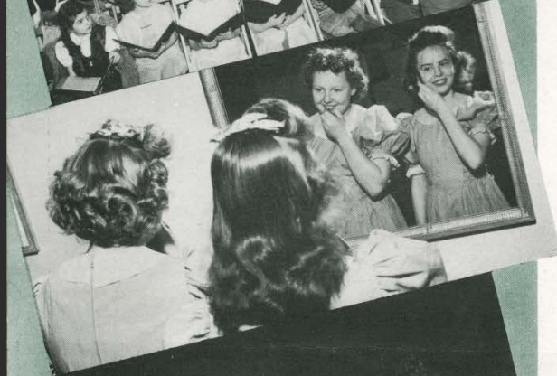
The great night has arrived, so these two misses primp up just before they are to make their appearance.