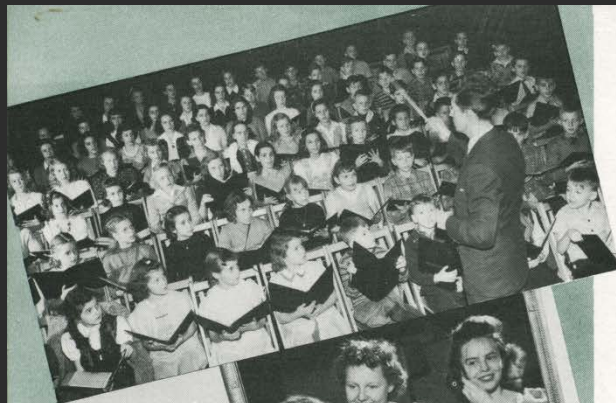
Here in the basement of the Loretto, untrained voices are schooled to blend as one harmonious vibrant unit.