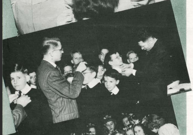
Ties must be straight, hair slick, so Personnel executives lend a hand to see the boys are spick and span.