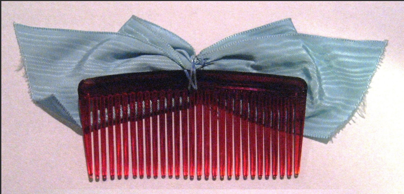
Girls bow (back view) with comb attached (1964)