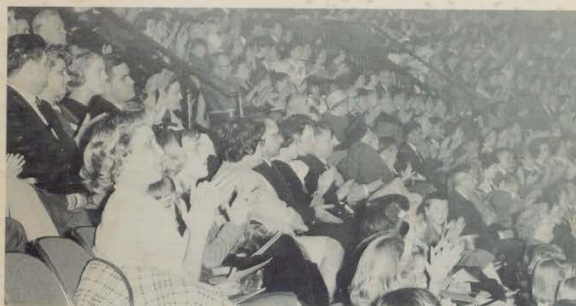
. . . before a concert captivates an audience and earns its enthusiastic applause.