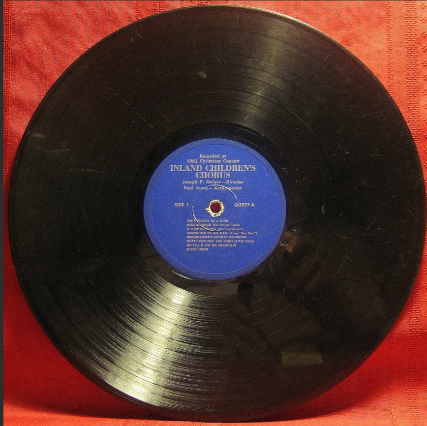
Side 1: 1963/4 Blue Label 12-inch 33 rpm