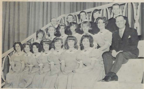
These youngsters graduated from the Inland Children's Chorus in 1964. Many will further their musical education in other areas.

Side One (Recorded during 1963 Christmas Concert) The Birthday of a King Gesu Bambino (The Infant Jesus) O Christmas Tree (O Tannenbaum) Adoration of the Magi (From "Ben Hur") Grandfather's Holiday Favorites Thirty-two Feet and Eight Little Tails Go Tell It On The Mountain Silent Night