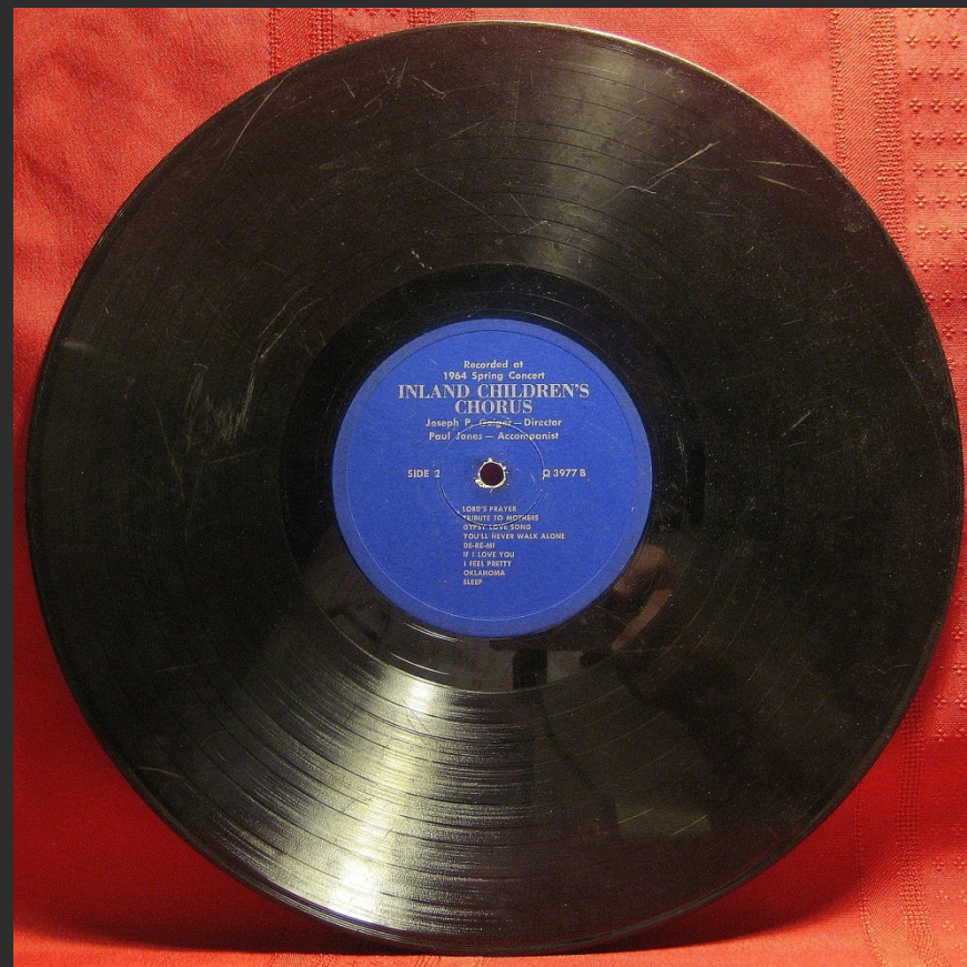
Side 2: 1963/4 Blue Label 12-inch 33 rpm