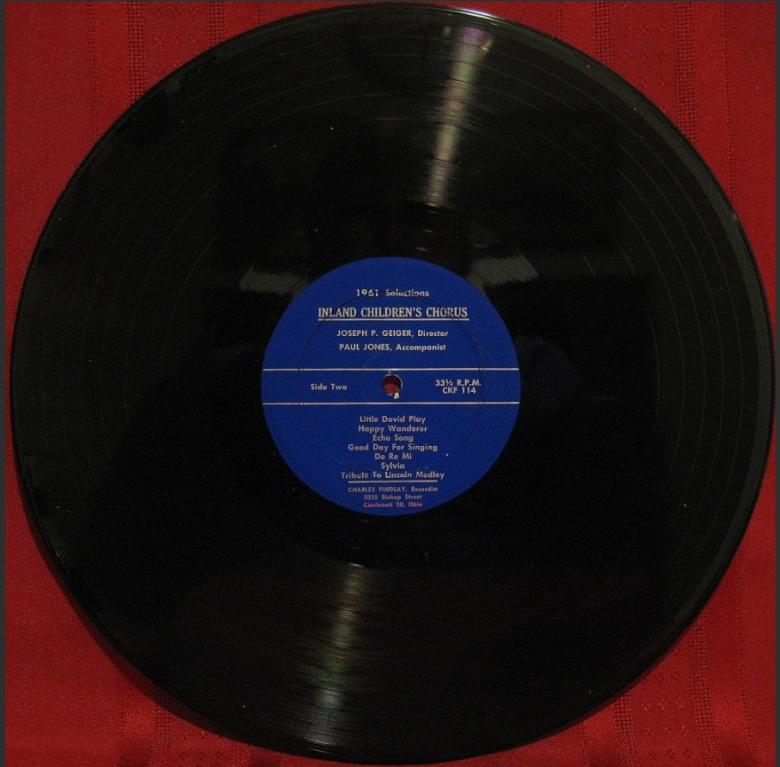
Side 2: 1961 Blue Label 12-inch Record