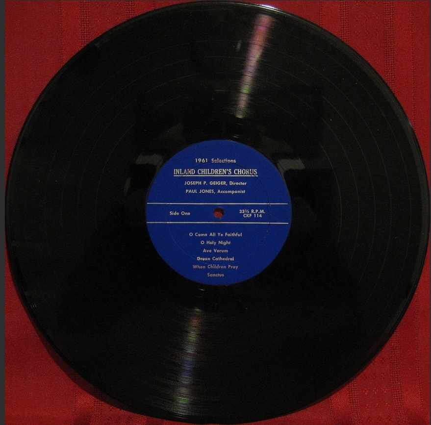
Side 1: 1961 Blue Label 12-inch Record