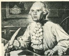
The acme of refinement and good taste in radio comes from Hell's Kitchen.