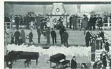
IT'S THE BIG MOMENT as Santa and his assistants distribute toys to wide-eyed children.