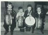
GIFT DRUMS FROM SANTA CLAUS and the sight of the photographer quieted these happy youngsters—for the time being.