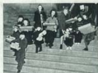
THE END OF A PERFECT PARTY for these gift-laden children. With a final look at the photographer they start happily towards home.