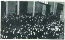
A THRONG OF EARLY ARRIVALS jammed Memorial Hall lobby just before the doors were opened.