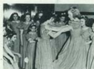
FUN BACKSTAGE between parties as these members of the Children's Chorus demonstrate that their talents are not entirely vocal.