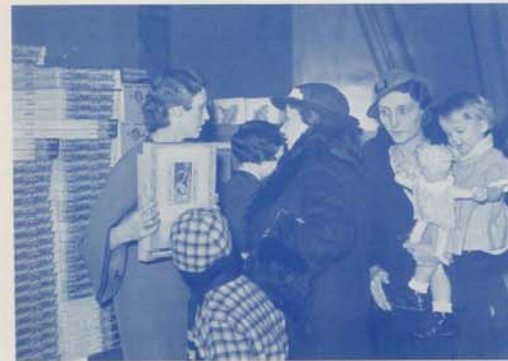
"Each Child Received a Toy, a Ball of Pop Corn and a Box of Candy"