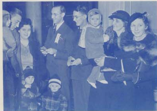
"At the Door"