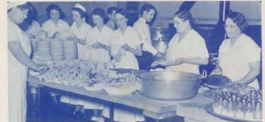
"The Children and Our Hard Working Party Organization Were Well Fed ... Preparing the Turkey Dinner"

"For my part, I pledge you the unceasing efforts of every officer and supervisor of this Company to make next year again the best year for all of us."