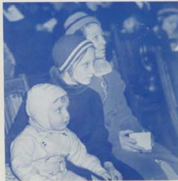
"Santa is About Due"