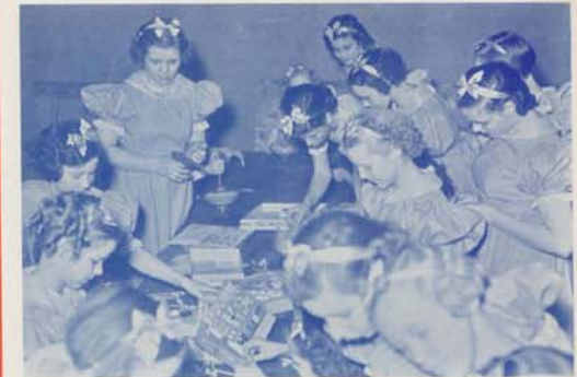
"It Wasn't All Work and No Play For Our Children"