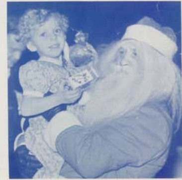
"No Comments Needed"