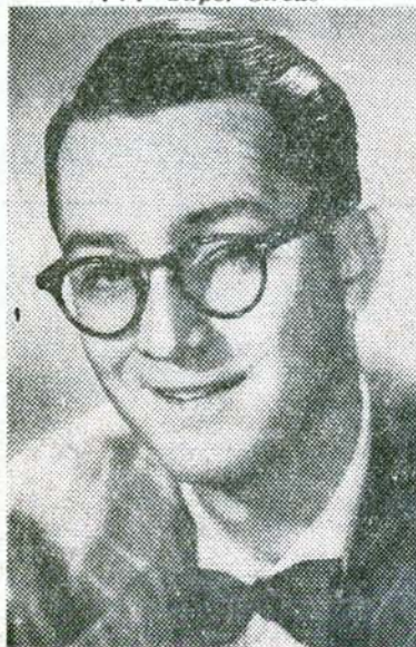
STEVE ALLEN ... TV star