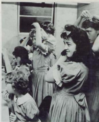
But there's ever so much to do when you are a girl!