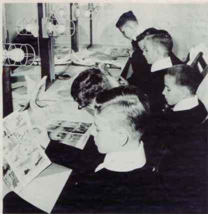
For the boys, there's time to relax before curtain call...