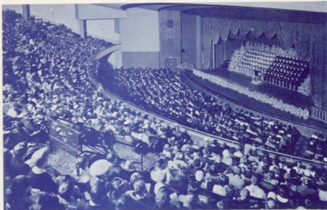
Inland Children's Chorus Sings Christmas Concert to capacity audience.

O COME, O COME EMMANUEL LITTLE DRUMMER BOY CHRISTMAS ROUNDELAY DING DONG MERRILY ON HIGH GOD SO LOVED THE WORLD SILENT NIGHT