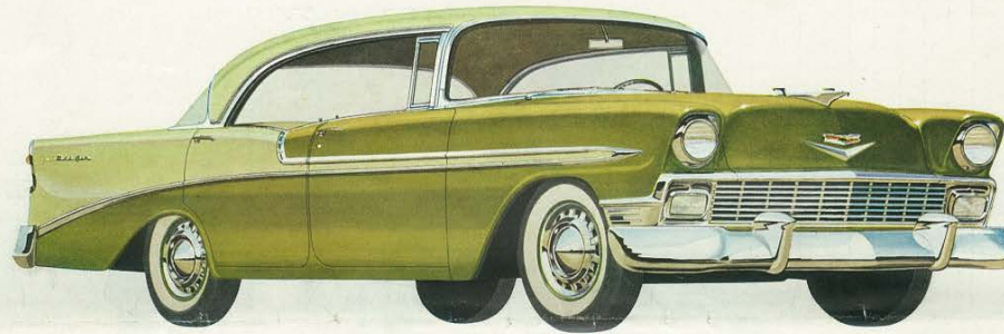
THE BEL AIR SPORT SEDAN—one of two new 4-door hardtops

It's the new 1956 Chevrolet—with bold new Motoramic styling . . . frisky new models . . . and more of the dynamite action that's zoomed its way into America's heart!