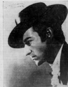
JOSE GRECO —and his company of SPANISH DANCERS will present a program of authentic Spanish dances the night of Nov. 12. This ensemble has taken the United States by storm. Held out Hollywood Road. Dates previous from the entire Dayton area are reaching reservations.