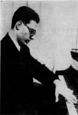
LEON FLEISHER —brilliant young pianist. Substituted with the orchestra Feb. 21. Has had numerous fine appearances with the "Queen of Belgium Award." His nationwide tour for the 1952-53 season has been sold out for almost a year.

OFFICIAL date for the formal opening of the 1953-54 season of concerts by the Dayton Philharmonic Orchestra is Thursday night, Oct. 29. Assisting guest artist for this important musical occasion will be Yehudi Menuhin, ebullient violinist, one of the musical giants of our time. The season throughout will be one of quality and of great variety aimed to satisfy a complete cross-section of musical tastes. The complete roster of assisting guest soloists is shown on this page together with the official concert dates. Tickets for all of these concerts are now on sale at the Philharmonic Orchestra headquarters in the Biltmore Hotel. Special rates are arranged for season tickets and for students of high schools and colleges in the Dayton area. The management of the orchestra urges all who are interested in season tickets or in reservations for any one of the concerts listed here-with to contact the headquarters office as early as possible to assure preferred seats. UHton 1175.