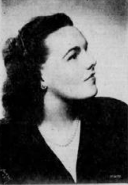
EILEEN FARRELL —soprano. Considered by critics unanimously as one of the world's greatest singers. Substituted for the closing concert of the season, April 18. Miss Farrell has the distinction of having had more appearances with the New York Philharmonic than any other living person. Her program for Dayton will include some of the best known arias from opera and a group of songs in English.