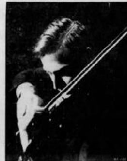
YEHUDI MENUHIN —violinist. Opened the 1952-53 season, NEWSEWER had this to say of his last Carnegie Hall recital: "It was technical wizardry, coupled with interpretative powers of the highest order. The fair-haired boy with gold in his hair has outdone his growing years. The stream of tone and technique had been fulfilled and at 30 a master musician has come of age."