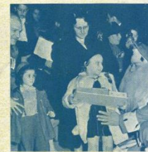
Just a little bit shy but nevertheless happy to meet Santa Claus, is this little lady, as others await their turn.