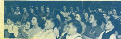
Intently watching the movies between parties are these members of the Children's Chorus.