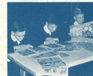
Comic sheets . . . Relaxing between shows are these members of the Inland Children's Chorus.