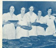
Pumpkin pies . . . Dinner for those who helped stage party was provided by the Inland Cafeteria.