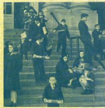
And after the festivities were over each child left the party with gifts from Santa. Here a group leaves Memorial Hall.